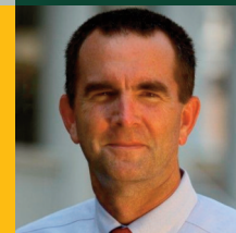
Ralph S. Northam Democrat