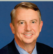
Edward W. “Ed” Gillespie Republican

In keeping with its mission, the Virginia Catholic Conference aims to educate and inform Catholics about a wide range of issues. The information listed here was compiled as of Aug. 31, 2017, from policies, public statements, official and campaign websites and other resources to help voters inform their consciences before heading to the voting booth. The issues do not represent a complete list of issues that may be of importance to Catholics. The Conference neither supports nor opposes any candidate for public office. The underlined text below indicates a hyperlink to the source. Go to www.vacatholic.org to view these links.