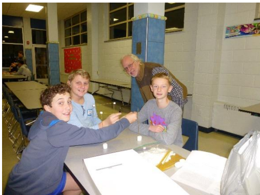
Edge 6 th Grade Boys

Middle school youth and their families are invited to sit together at the above Masses. Pews will be reserved in front of the choir. Please arrive at least five minutes before Mass to secure a spot.