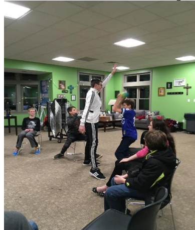
New Year’s Eve Party