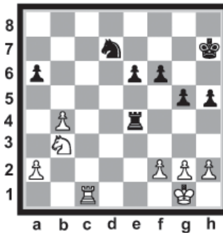
Chess Tactics: White to Set a Pin