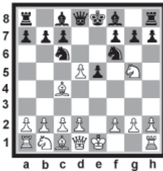
Chess Openings: Two Knights Defense